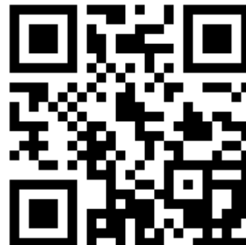
“Neighbourhood Bottle Reward Scheme” https://drinkwithoutwaste.org/resources-new/

“Neighbourhood Bottle Reward Scheme” hotline and WhatsApp: +852 9545 5107