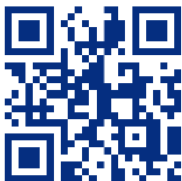
Facebook Page @drinkwithoutwaste

Follow Drink Without Waste Facebook Page and Website stay tuned for the latest information regarding the Scheme.